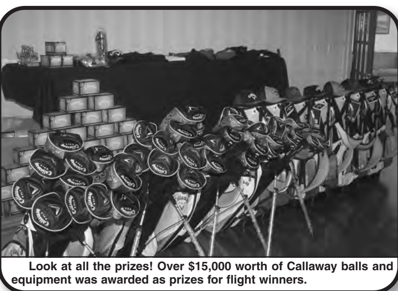
Look at all the prizes! Over $15,000 worth of Callaway balls and equipment was awarded as prizes for flight winners.